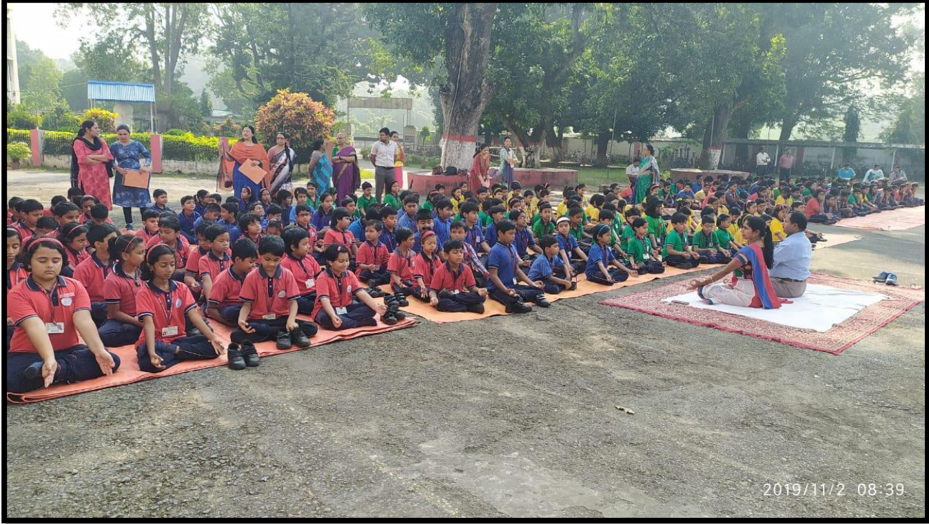
YOGA CLASSES AFTER THE MORNING ASEMBLY