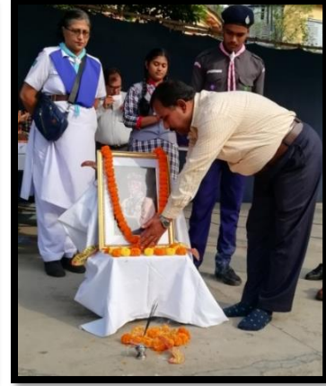
GARLANDING BY RESPECTED PRINCIPAL, VICE PRINCIPAL & HEAD MASTER