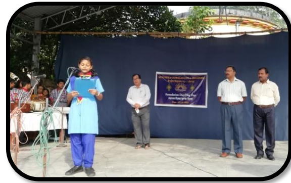
SPEECH ON THE IMPORTANCE OF THE AUSPICIOUS DAY